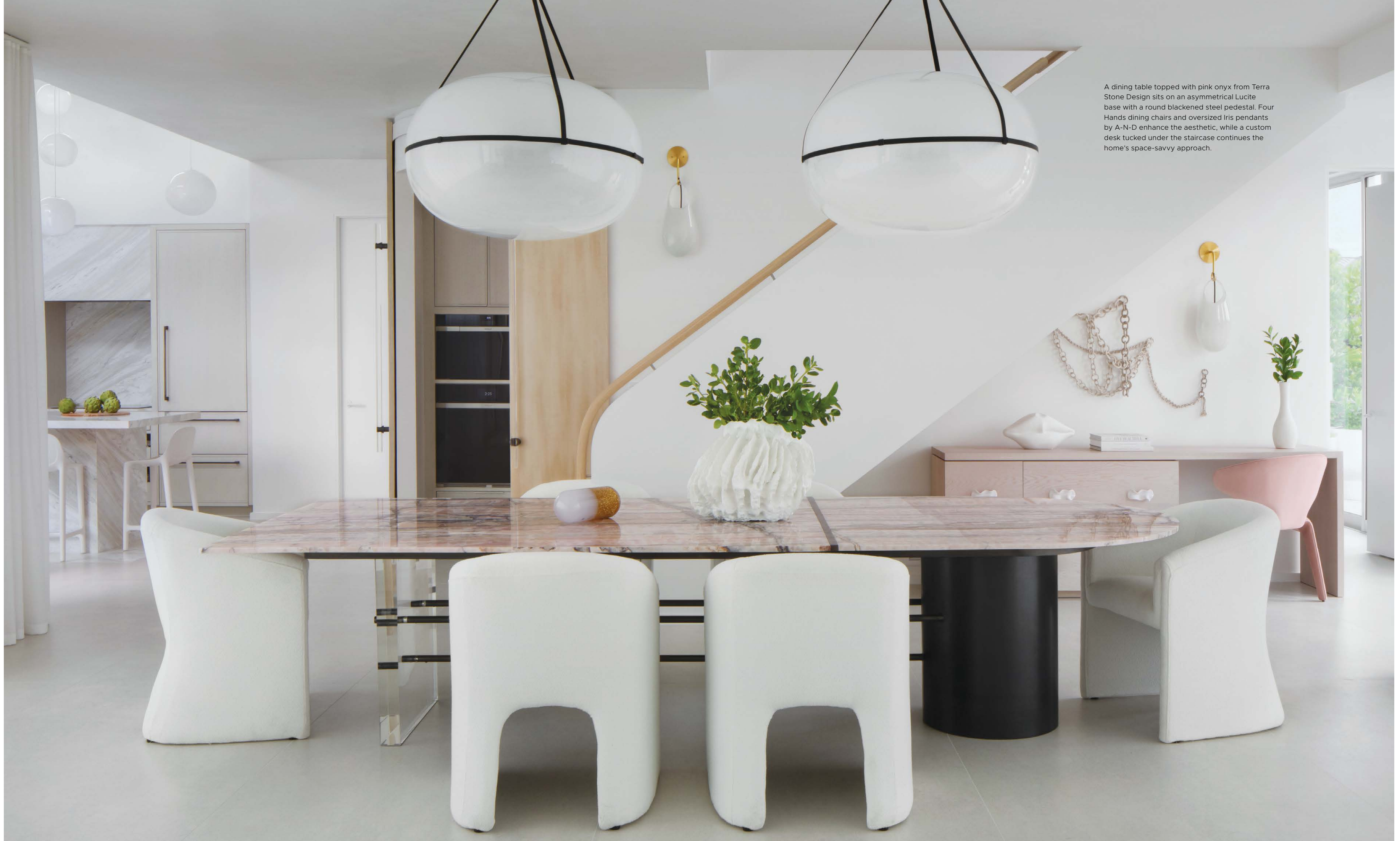
A dining table topped with pink onyx from Terra Stone Design sits on an asymmetrical Lucite base with a round blackened steel pedestal. Four Hands dining chairs and oversized Iris pendants by A-N-D enhance the aesthetic, while a custom desk tucked under the staircase continues the home's space-savvy approach.