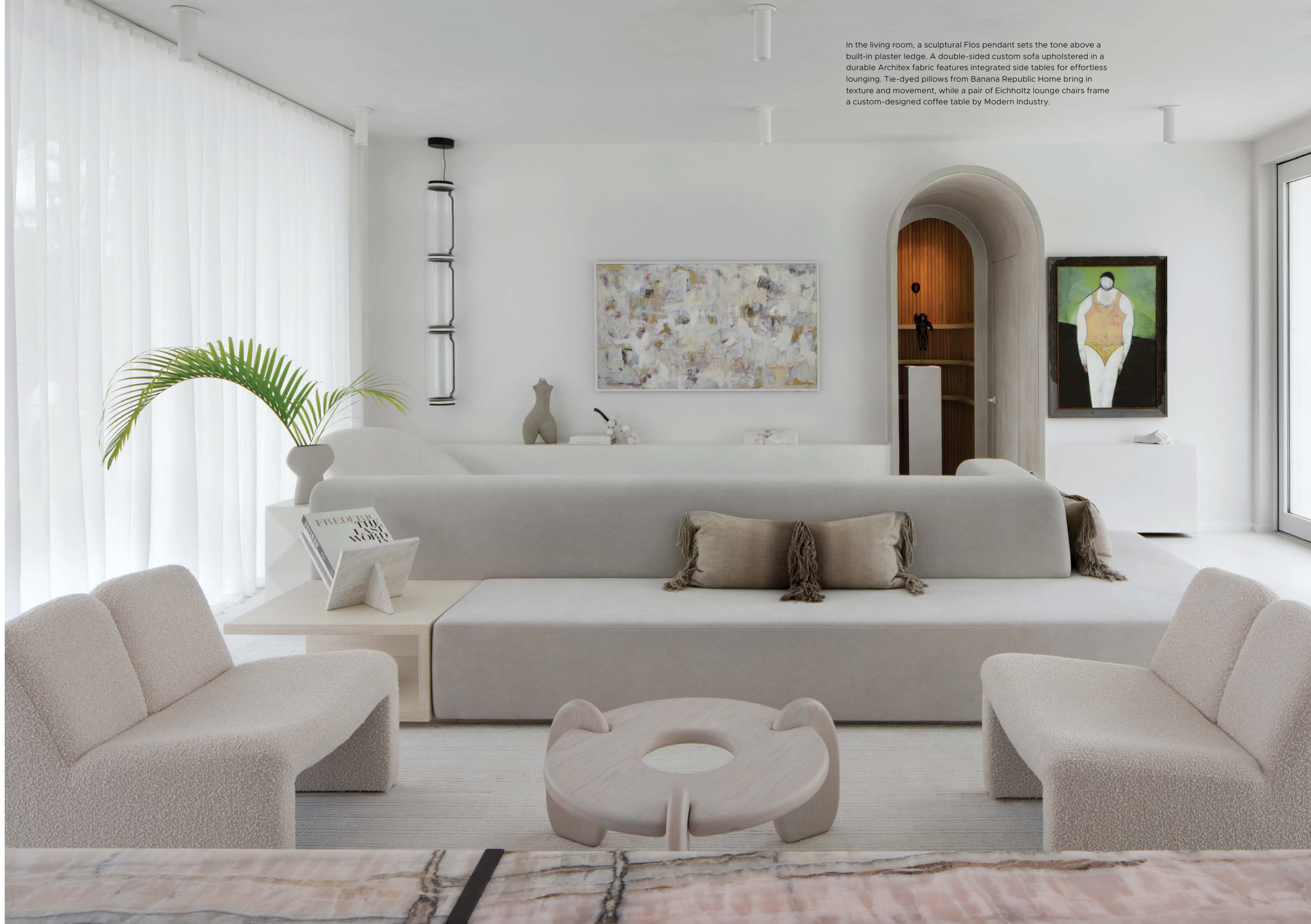
In the living room, a sculptural Fios pendant sets the tone above a built-in plaster ledge. A double-sided custom sofa upholstered in a durable Architex fabric features integrated side tables for effortless lounging. Tie-dyed pillows from Banana Republic Home bring in texture and movement, while a pair of Eichholtz lounge chairs frame a custom-designed coffee table by Modern Industry.

Instead of bold contrasts, the design team focused on subtle texture shifts—pale woods, honed stone, plastered surfaces, and layered textiles—that added warmth and depth without stealing the spotlight. Natural light was a major part of the