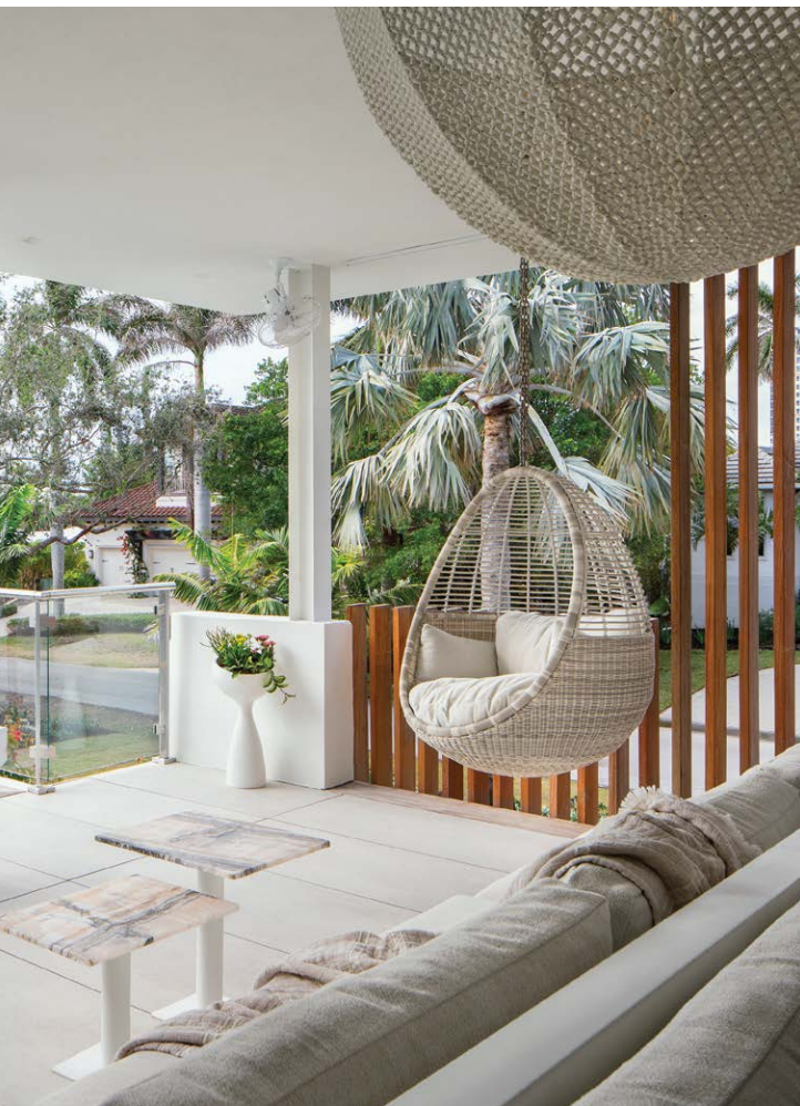
ABOVE: A covered outdoor space equipped with a television has become a favorite family hangout for entertaining and game days. Custom two-sided sectionals and marble drink tables accommodate larger crowds, and the hanging chair offers a lulling place to relax and unwind.