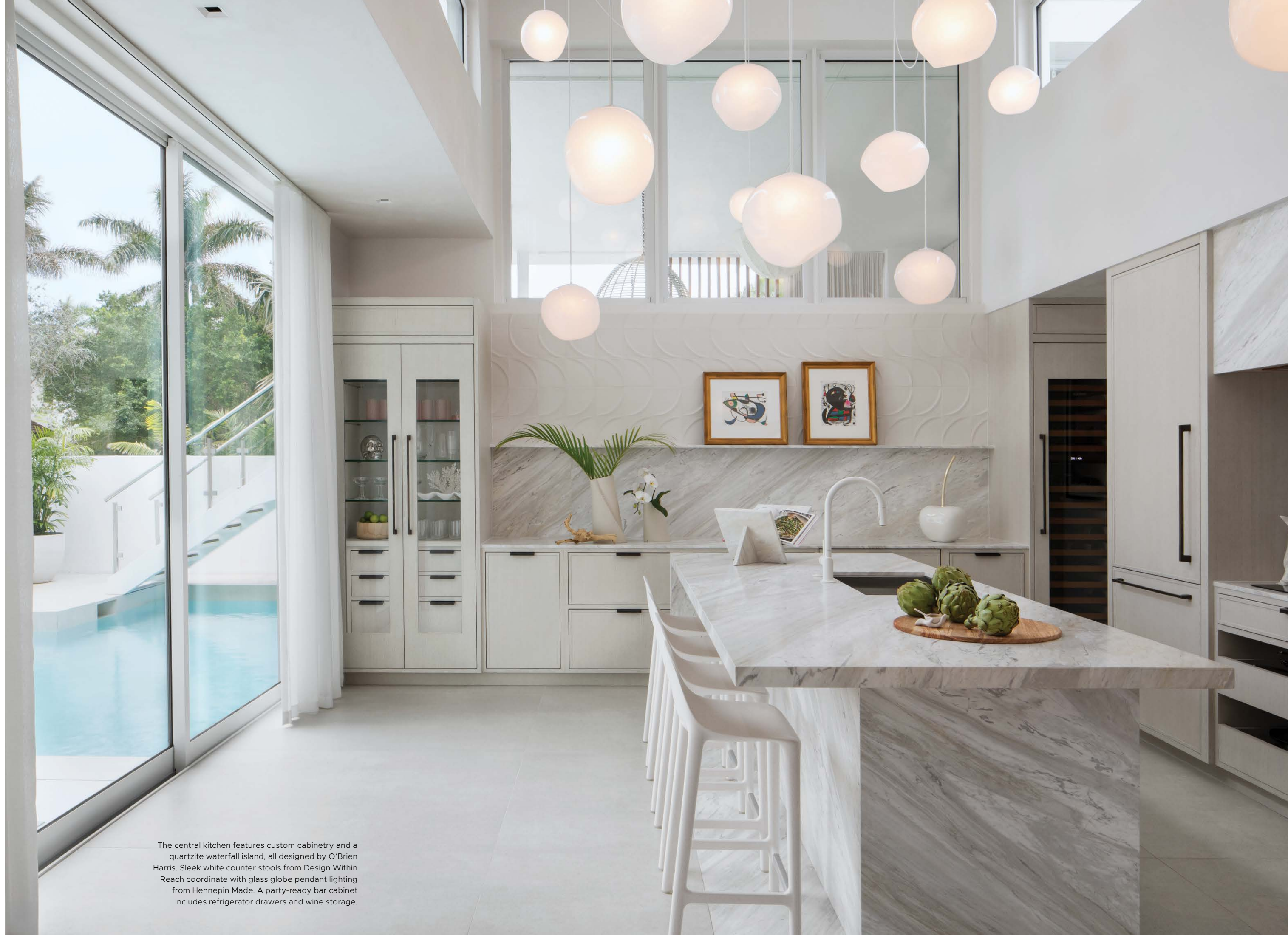
The central kitchen features custom cabinetry and a quartzite waterfall island, all designed by O'Brien Harris. Sleek white counter stools from Design Within Reach coordinate with glass globe pendant lighting from Hennepin Made. A party-ready bar cabinet includes refrigerator drawers and wine storage.