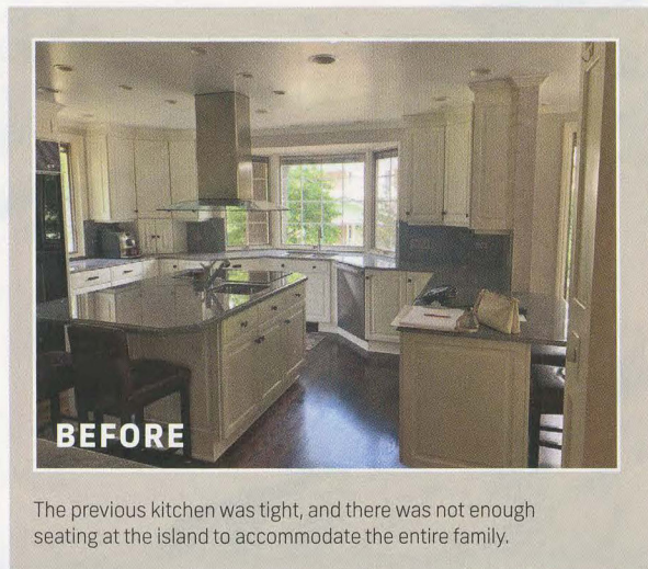
The previous kitchen was tight, and there was not enough seating at the island to accommodate the entire family.

"Taking those color cues from the marble, we pulled a greenish black for the bar area and butler's pantry," said O'Brien, who added that the walnut divider in the kitchen provides some warmth to the space.