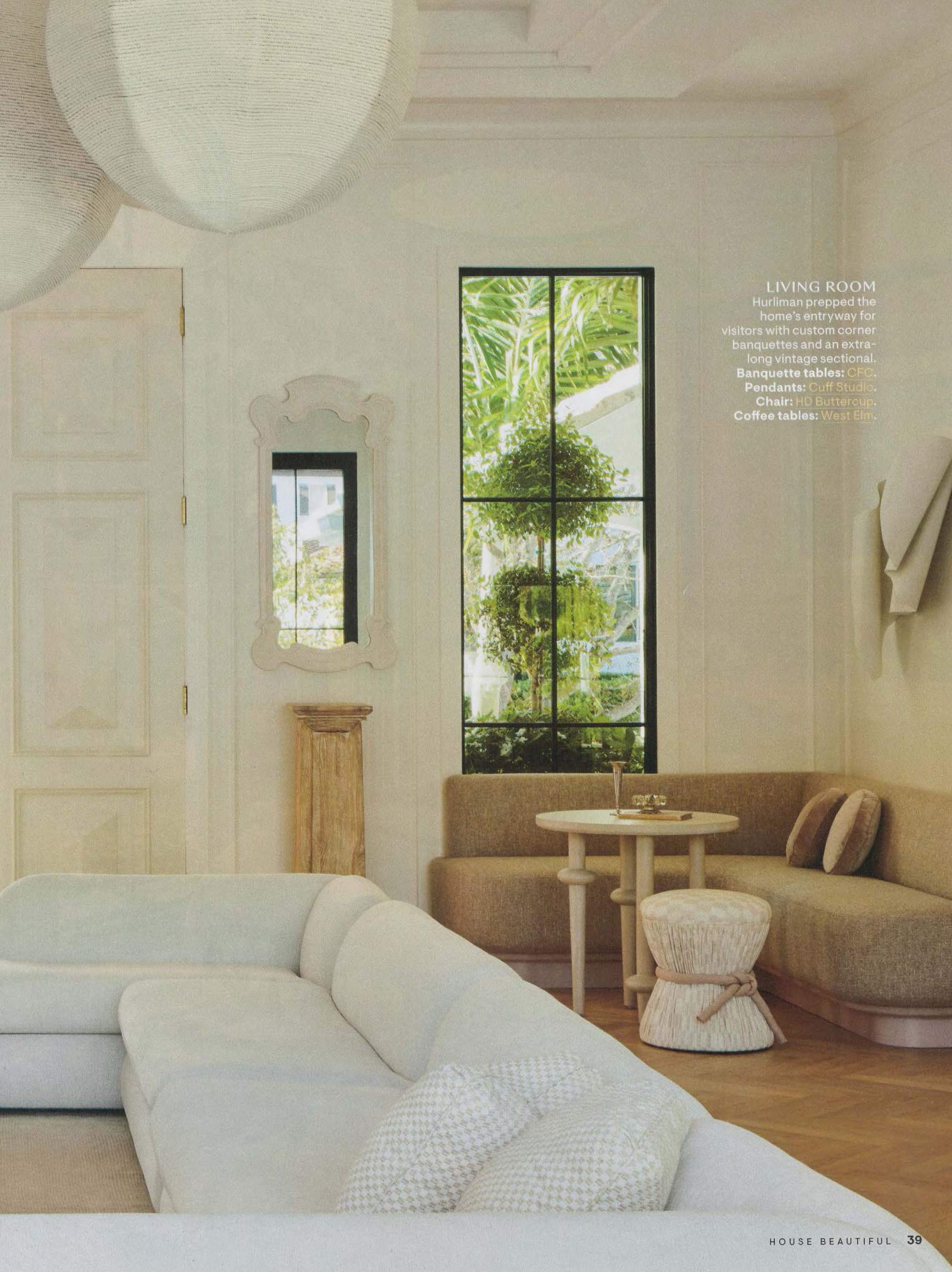
LIVING ROOM Hurliman prepped the home's entryway for visitors with custom corner banquettes and an extra-long vintage sectional. Banquette tables: CFC. Pendants: Cuff Studio. Chair: HD Buttercup. Coffee tables: West Elm.