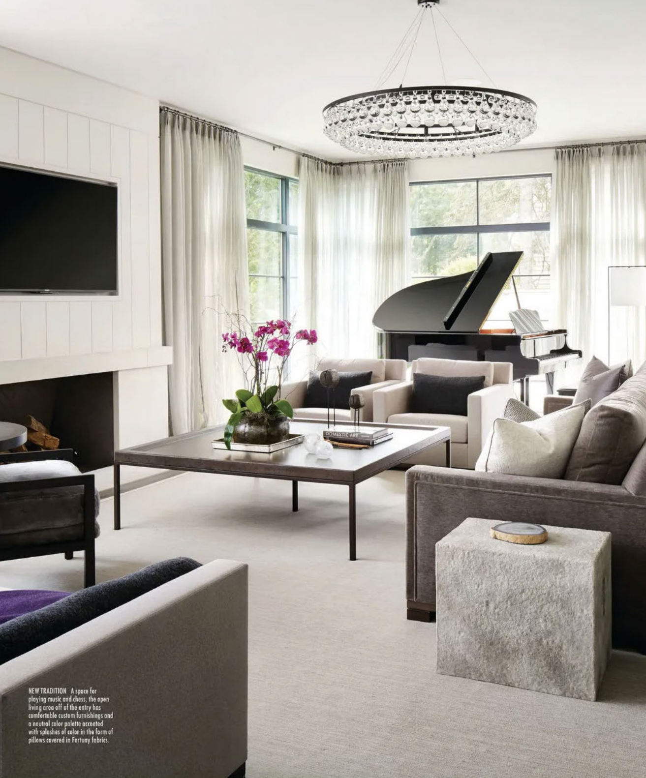
NEW TRADITION A space for playing music and chess, the open living area off of the entry has comfortable custom furnishings and a neutral color palette accented with splashes of color in the form of pillows covered in Fortuny fabrics.