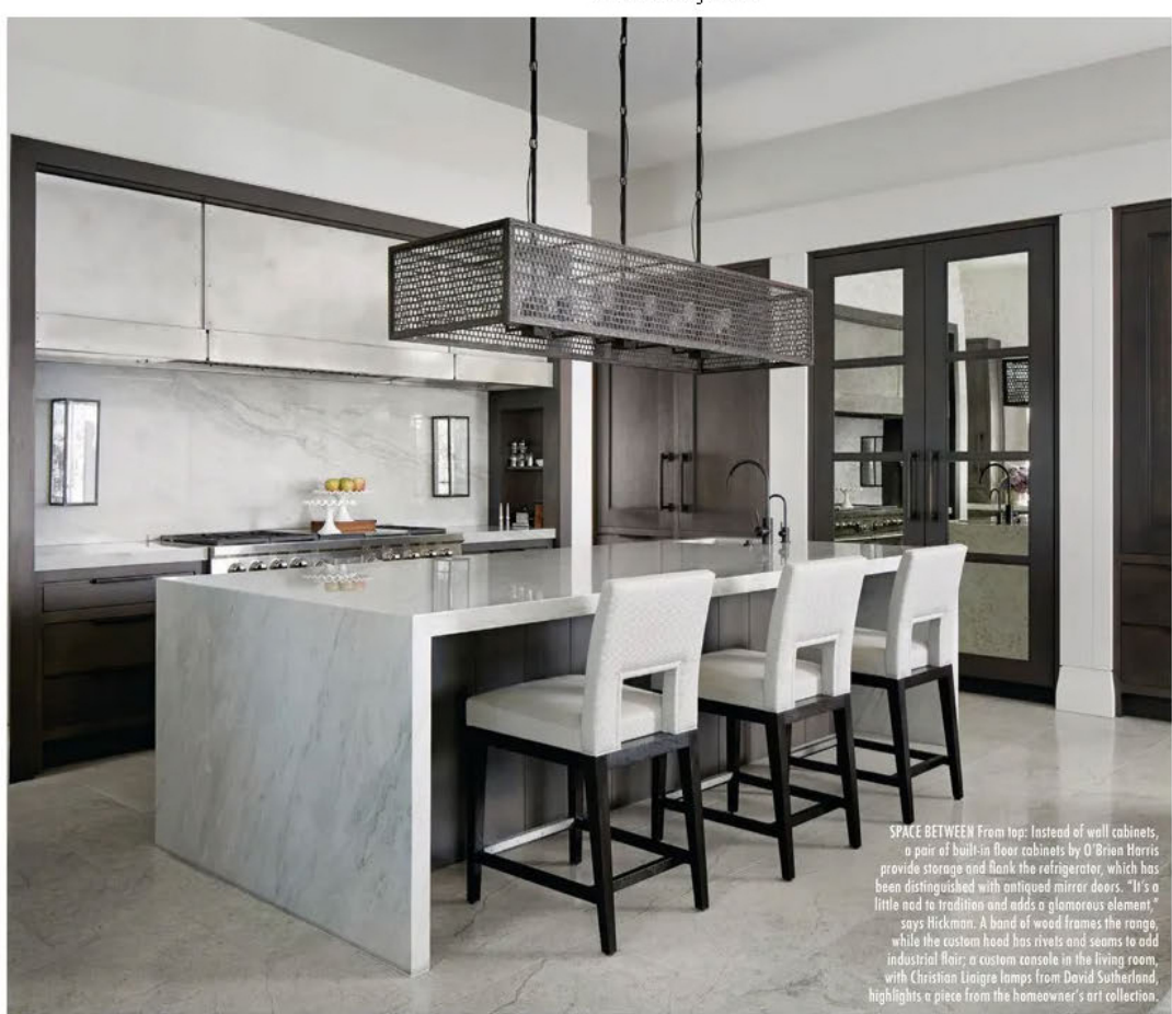
SPACE BETWEEN From top: Instead of wall cabinets, a pair of built-in floor cabinets by O'Brien Harris provide storage and flank the refrigerator, which has been distinguished with antiqued mirror doors. "It's a little nod to tradition and adds a glamorous element," says Hickman. A band of wood frames the range, while the custom hood has rivets and seams to add industrial flair; a custom console in the living room, with Christian Liaigre lamps from David Sutherland, highlights a piece from the homeowner's art collection.

that unite the open spaces on the main level and also highlight the home's inherently modern architectural features. "We decided early on to keep the paint color on the whole floor consistent," Hickman explains. "The trim is the same color as the walls."